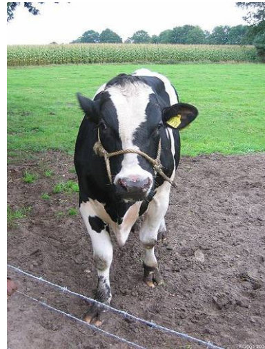
Frisian cow

The Netherlands is the second biggest exporting country of agricultural products in the world.