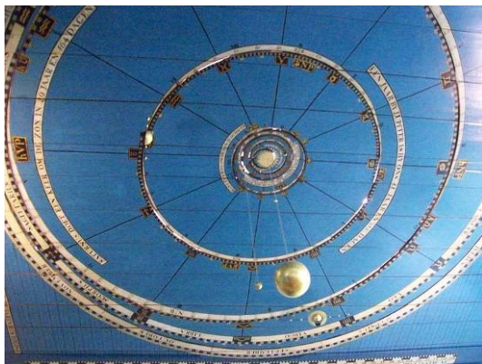
Eisinga's Planetarium

Because of their knowledge of the times, the second emblem of the tribe of Issachar is sun & moon . This emblem is used more often than the donkey .