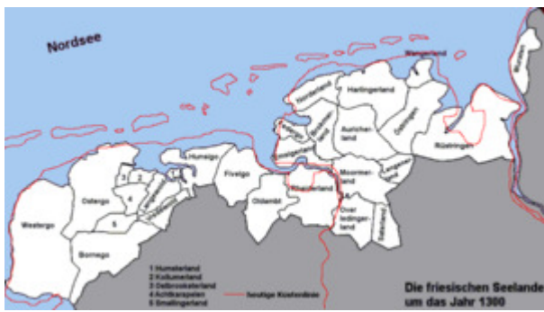
Frisian areas around 1300 (Wikipedia)