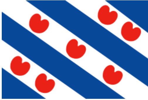
Flag of Frisia, with seven lilies

In that light we should see the Frisian lands. The seven stripes and the seven water-lilies in the Frisian flag stand for those seven Frisian (sea-)lands. Those Frisian lands are lovely, agrarian, rustic, dotted with villages. Green polders, blue skies and white clouds, with black and white Frisian cows can be seen from West Frisia to East Frisia. Issachar saw that the land was pleasant. That's why there is no independent Frisian nation.