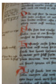
The Kodeks Roarda is a medieval document with Latin and Old Frisian law texts

Wikipedia: Lex Frisionum, the "Law Code of the Frisians", was recorded in Latin during the reign of Charlemagne, after the year 785, when the Frankish conquest of Frisia was completed by the final defeat of the Frisian king Radboud. The law code covered the region of the Frisians.