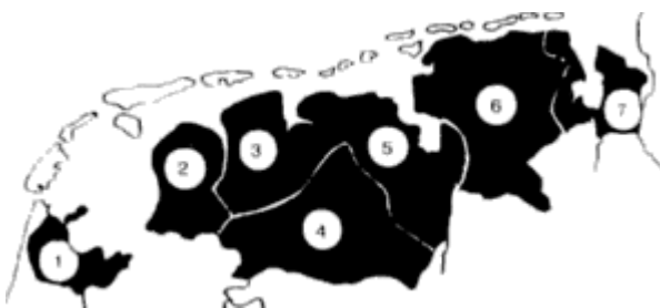
Seven Frisian Seelands