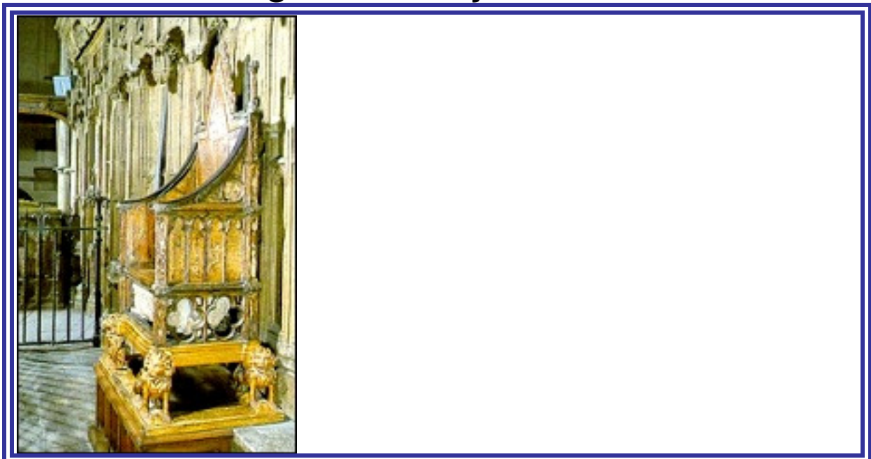
PHOTO CAPTION: The Coronation Chair was built around the Stone of Scone

God told the Prophet Nathan to inform King David of God's plan to build David an "HOUSE"—an everlasting ROYAL DYNASTY : "Also the LORD tells you that He will make you a HOUSE" (2 Sam. 7:11; 12-29). Jacob's pillow stone , which he sanctified by anointing it with oil , would become a symbol of that ROYAL HOUSE among God's people Israel! That " pillar " was later used in the coronation of the ancient kings of Judah. About 835 BC, Joash was crowned in a manner very similar to that used by the British today: "And he [the priest] brought out the king's son [ Joash ], put the crown on him, and gave him the Testimony : they made him king and anointed him , and they clapped their hands and said, 'Long live the